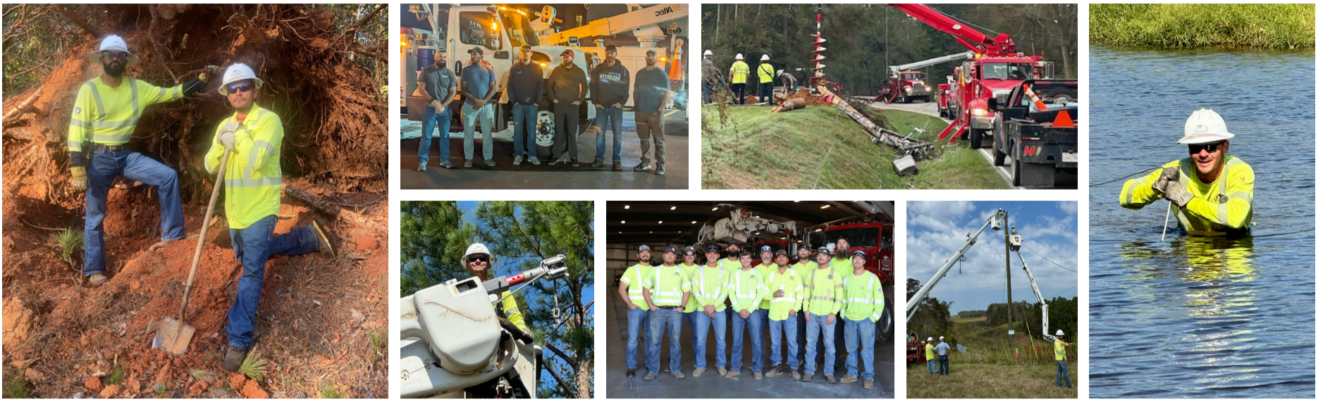
Above: Crews from some of Sunflower's member utilities responded to a mutual aid request from Aiken Electric Cooperative in South Carolina.